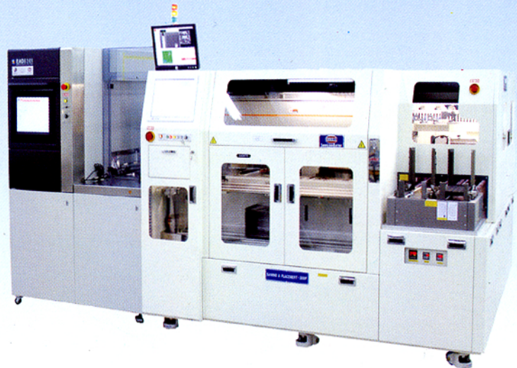
Model : SAWING & PLACEMENT - 3500F