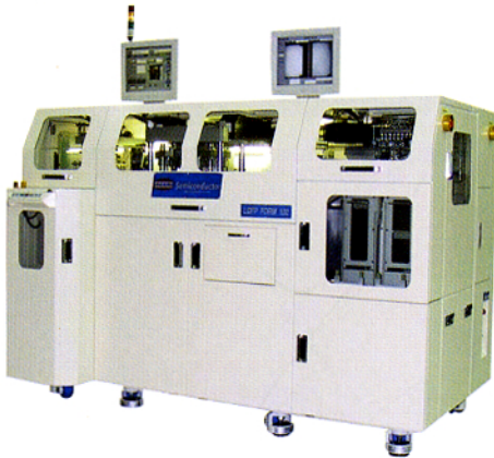
Model : FORM 102