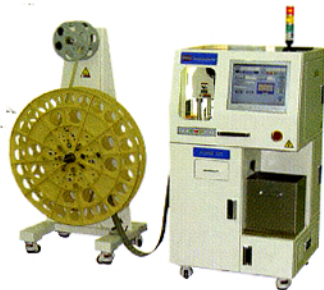
MICRO CAM PRESS TRIM & FORM